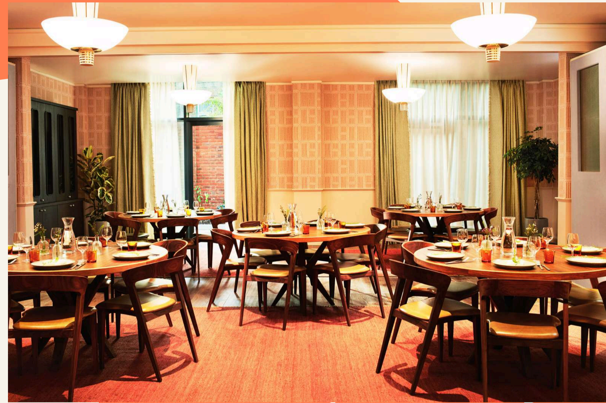
THE LIVING & DINING ROOM