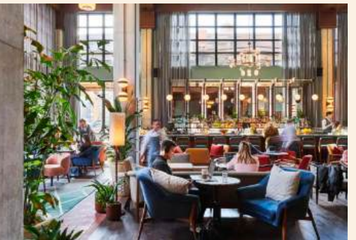
Chicago, Illinois | 182 rooms Situated in the Fulton Market District, one of Chicago's most creative neighbourhoods.