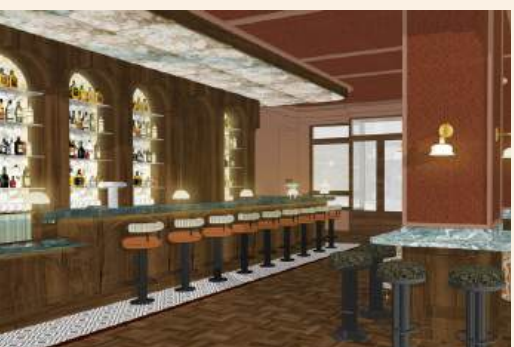
Dublin, Ireland | 129 rooms Sláinte! With a prime location on Exchequer Street, The Hox debuts in Ireland.