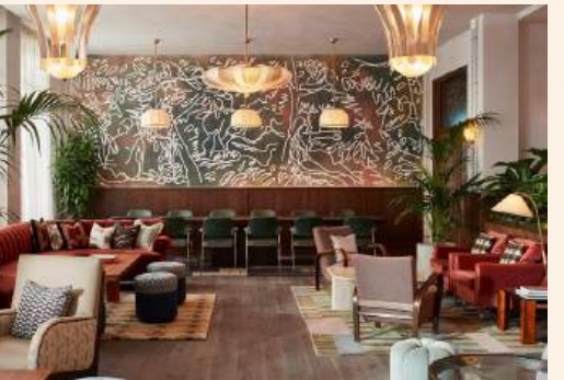
Charlottenburg, Berlin | 198 rooms Rolling out the Hox experience with our first Hoxton in Germany in the Art Nouveau area of Charlottenburg.