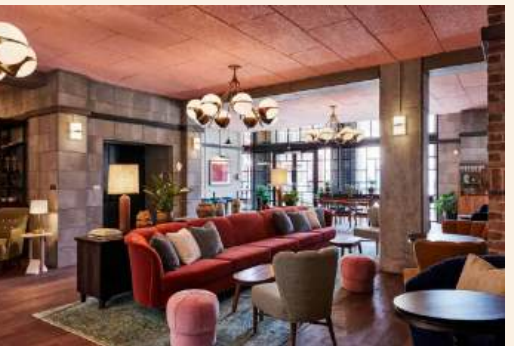
Portland, Oregon | 119 rooms In the Old Town Chinatown District.