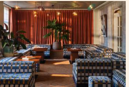
Lloyd Amsterdam | 136 rooms Neighbouring an original Dutch mill, our second Amsterdam outpost sits waterfront on the Eastern Docklands.