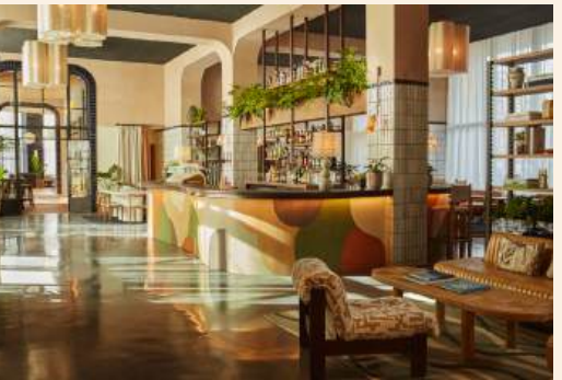
Poblenou, Spain | 240 rooms Bringing the Hox experience to Barcelona, in a popular beachside neighbourhood.