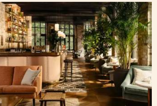
Southwark, London | 192 rooms Our third London Hoxton a stone's throw from South Bank.