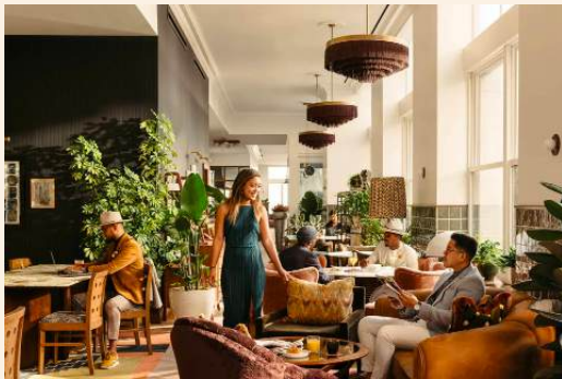
Downtown LA, Cali. | 174 rooms A historic Broadway building located in Downtown LA.