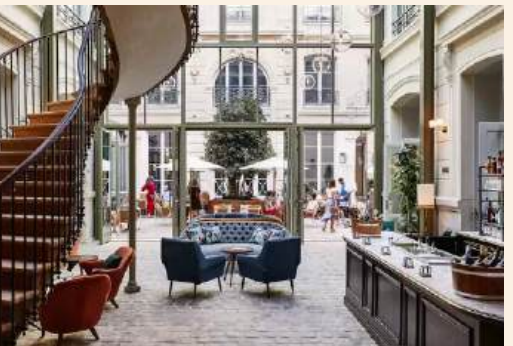
Paris, France | 172 rooms Located in Paris's 2nd Arrondissement.