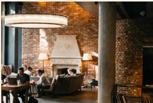
Shoreditch, London | 210 rooms Birth of the Hoxton Hotels, right in the heart of East London.