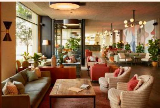
Holborn, London | 220 rooms Former BT Exchange building converted into second London Hoxton.