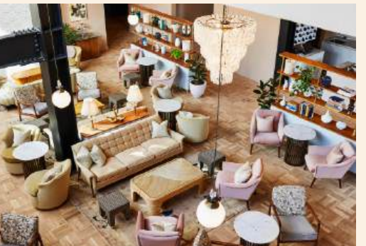
Williamsburg, NYC | 175 rooms Situated in Brooklyn's creative heart, Williamsburg.