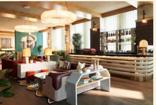
Brussels, Belgium | 198 rooms Our debut in the capital of Europe, right by the Botanical Gardens.