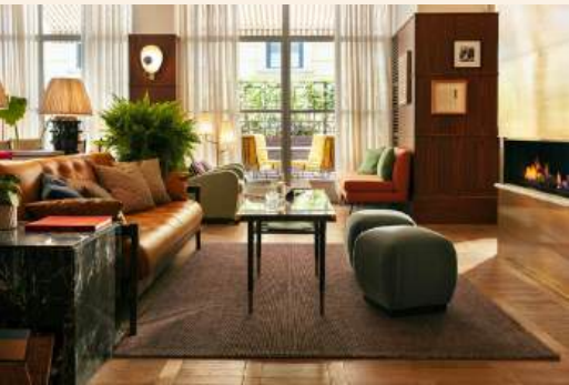
Rome, Italy | 192 rooms Our first Hoxton in Italy, situated in the leafy neighbourhood of Parioli.