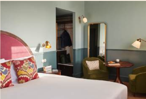
Edinburgh, Scotland | 214 rooms Our first UK foray outside London, in the buzzing Scottish capital.