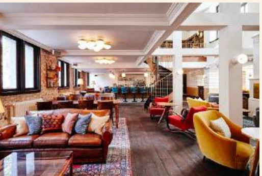
Herengracht, Ams. | 110 rooms Our first Hoxton outside of London on the Herengracht Canal.