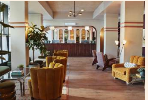
Shepherd's Bush, London | 237 rooms Our fourth London Hoxton goes West, as the gateway to eclectic W12.