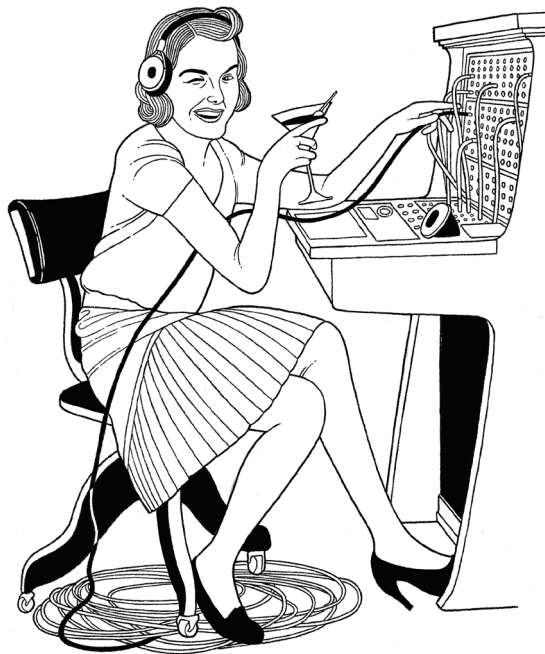
Illustration by Toby Triumph